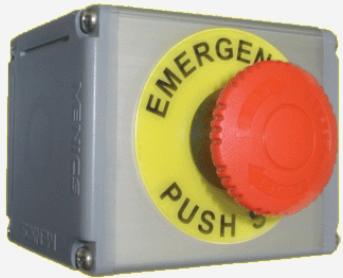
Part # 52-302